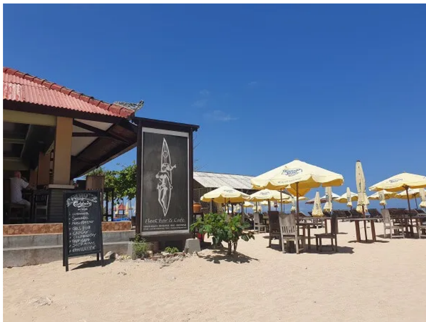
Geger Beach Warungs

place. Geger Beach is one of the hidden secrets in Nusa Dua, but is just a bit further along from the main Nusa Dua Beach. It is cheap, hidden, quiet, and you will find most of the local expats hiding out here.