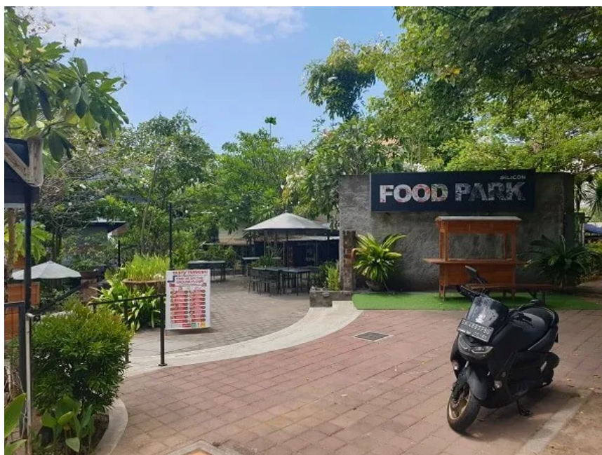
Silicon Food Park, Nusa Dua

If you are looking for where to eat in Nusa Dua, and want a really great selection of foods from all over the world, then head on up to Silicon Food Park . Here, you can expect to find anything from Indonesian, to Turkish, to Italian food. Located on Jalan Siligita right at the top of the hill, it offers up so many options that you will probably just keep returning.