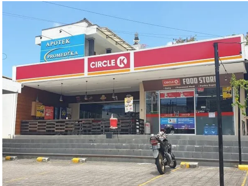
Circle K, Nusa Dua

The good old Circle K has recently been upgraded all around Bali. Every decent size store has now been turned into a “Korner Kafe” and serves up great iced coffees, Hotdogs, burgers and pizzas! There are always specials on, but basically for the price of around 4USD you can get an iced coffee and hotdog, or some other easy combo.