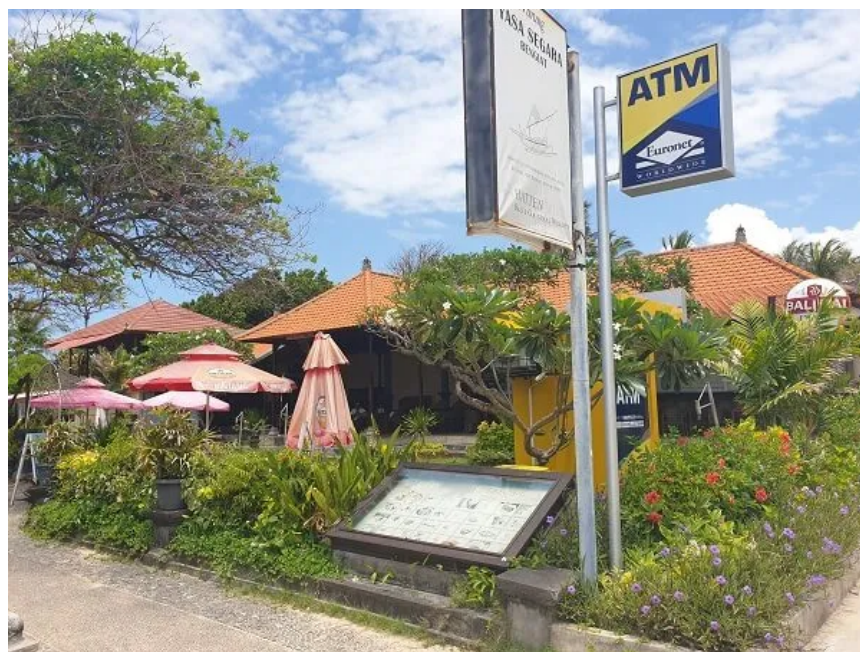
Warung Yasa Segara, Mengiat Beach

If you are heading down to Mengiat Beach and are looking for a nice, affordable place to eat, then try this place! It is right on the beach, and is owned by the local Banjar. This effectively means that it is (almost) local prices, and is a great alternative to eating in your resort for those awfully inflated prices.