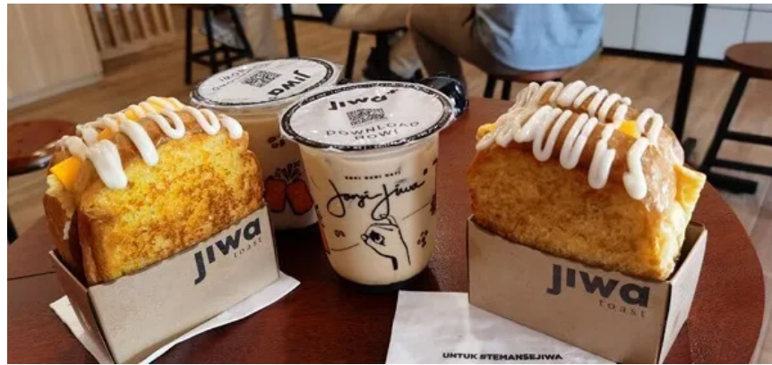
Janji Jiwa Toast and Iced Coffee

The Toast is incredible. They make the bread fresh on site, and it comes out of the toaster thick and soft. They have omelet inside, as well as a wide array of things on the menu, depending on what you order. One is enough to fill you up, and is perfect for breakfast. My favorite – the Ham and Cheese!