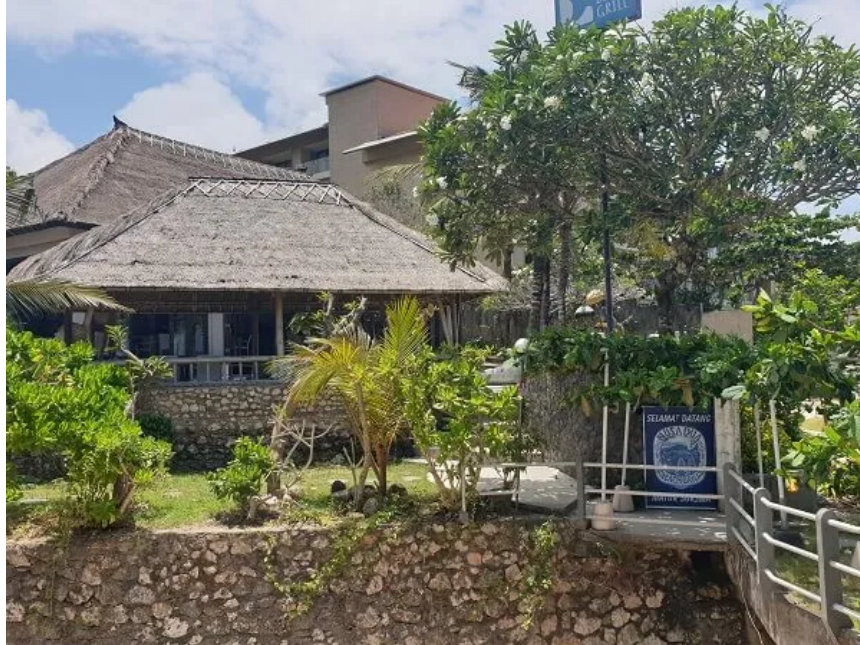
Nusa Dua Beach Grill

This place is a little harder to find, and personally I had lived in Nusa Dua for some time before I even knew of its existence. Once I did, though, I never looked back!