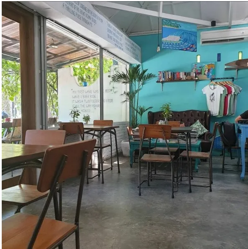
Secret Cafe, Nusa Dua

What we all love about Secret Café is that it is small, cozy, has that rustic feel about it, and serves consistently amazing food! The food is delicious, and so is the coffee. Personally, I keep on returning for the beautiful breakfasts, as do the dozens of expats that stop by on the way home from their morning surf every day.